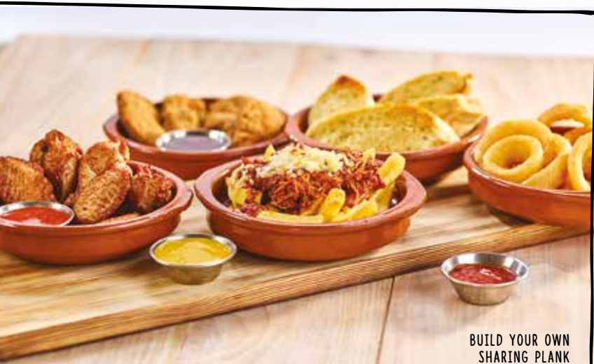
BUILD YOUR OWN SHARING PLANK