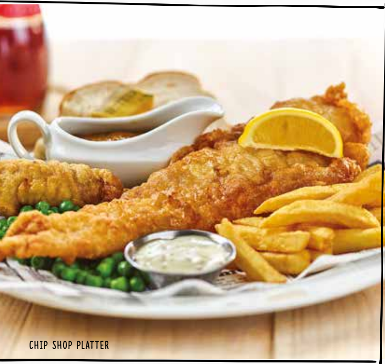
CHIP SHOP PLATTER