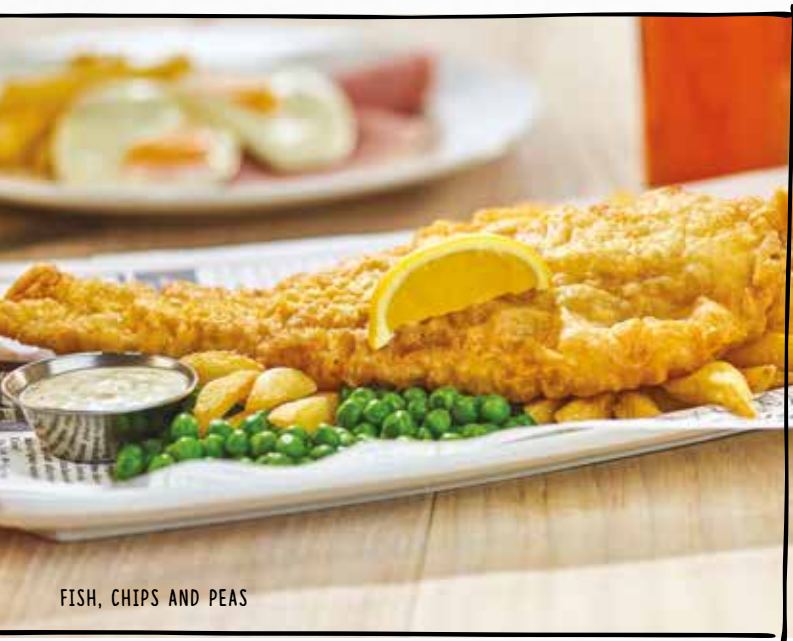
FISH, CHIPS AND PEAS