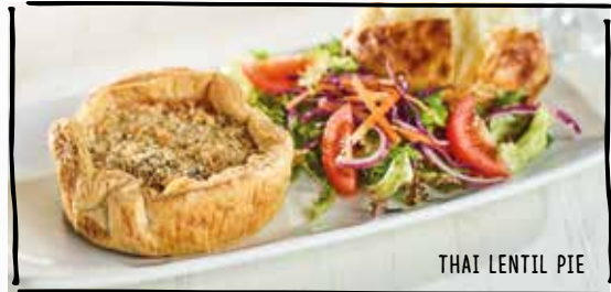
THAI LENTIL PIE