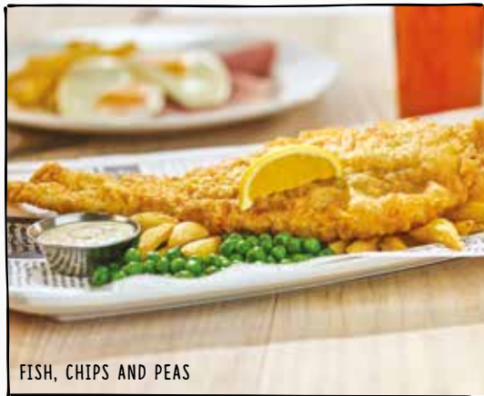
FISH, CHIPS AND PEAS

GO LARGE ADD TWO EXTRA SAUSAGES 1.00 EXTRA