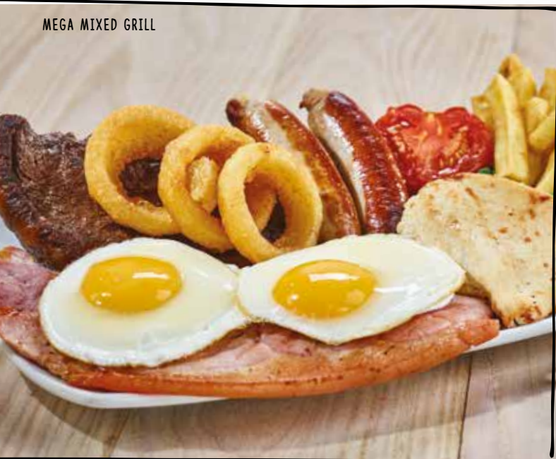
MEGA MIXED GRILL