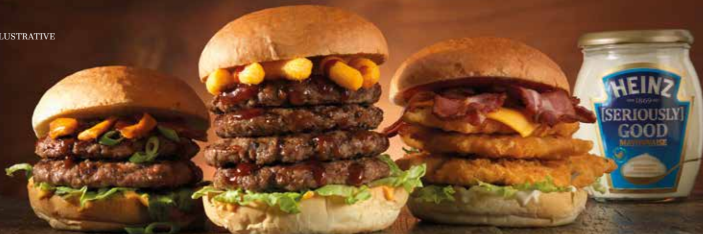
IMAGE IS FOR ILLUSTRATIVE PURPOSES ONLY