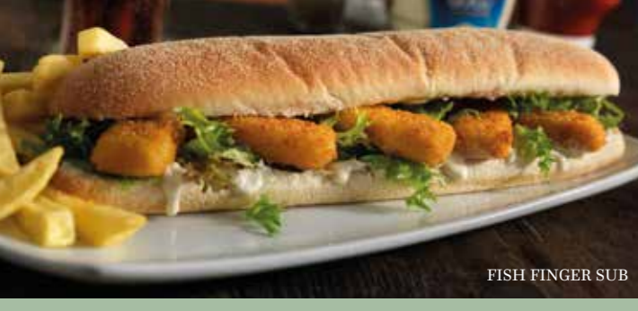
FISH FINGER SUB

Club sandwich, chips & a soft drink**† 5.99 Chicken breast with bacon, tomato, lettuce and mayonnaise, served in toasted bread. Sub or wrap, chips & a soft drink**† 5.99 SOUTHERN-FRIED BBQ CHICKEN MELT TOPSIDE BEEF MELT FISH FINGERS BAKED Quorn FISHLESS FILLETS v Swap your chips to nachos to make it vegan vg GRATED CHEESE AND TOMATO v