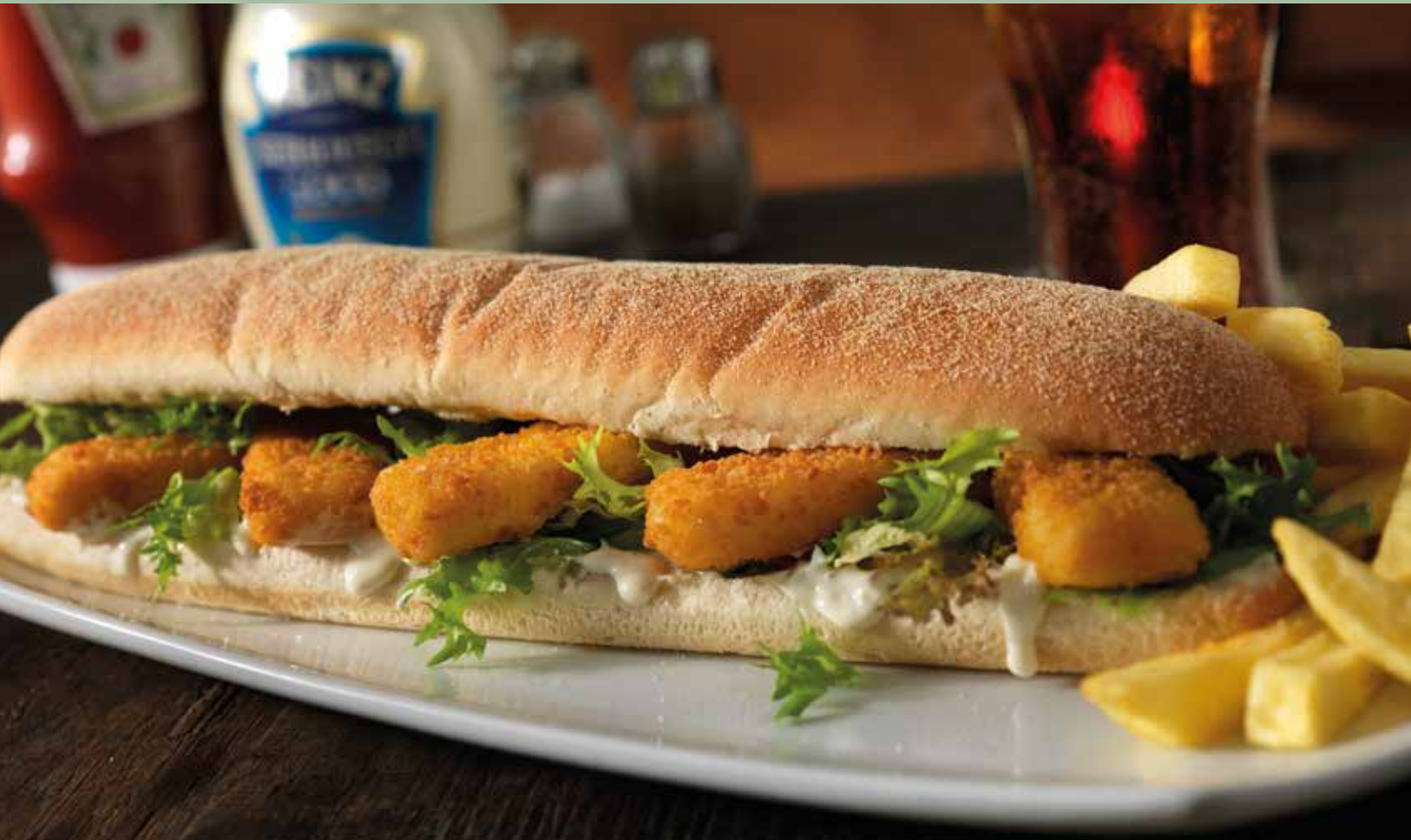
FISH FINGER SUB