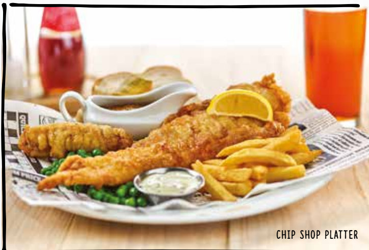
CHIP SHOP PLATTER

GO LARGE DOUBLE YOUR BBQ MELT 1.50 EXTRA