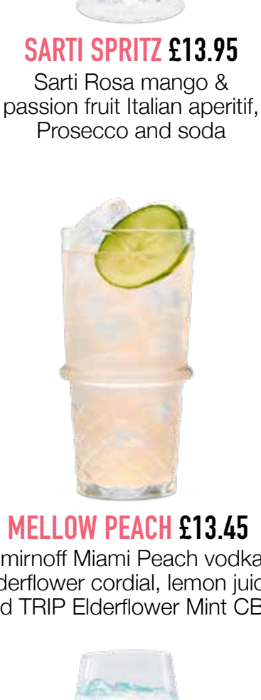
MELLOW PEACH £13.45 Smirnoff Miami Peach vodka. elderflower cordial, lemon juice and TRIP Elderflower Mint CBD