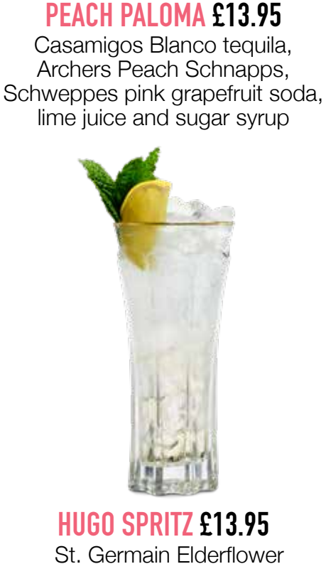
PEACH PALOMA £13.95 Casamigos Blanco tequila,