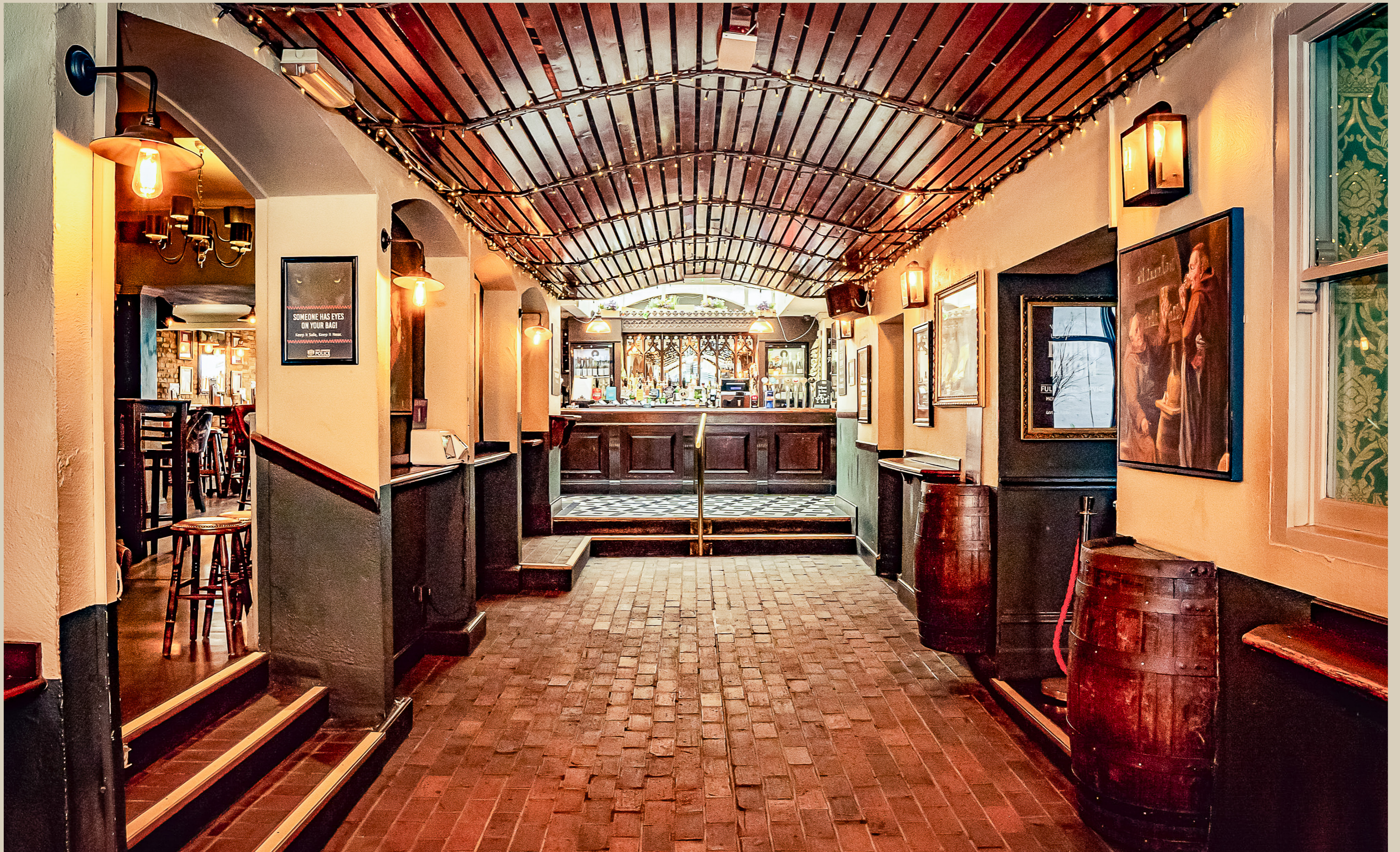
The Crutched Friar, City of London