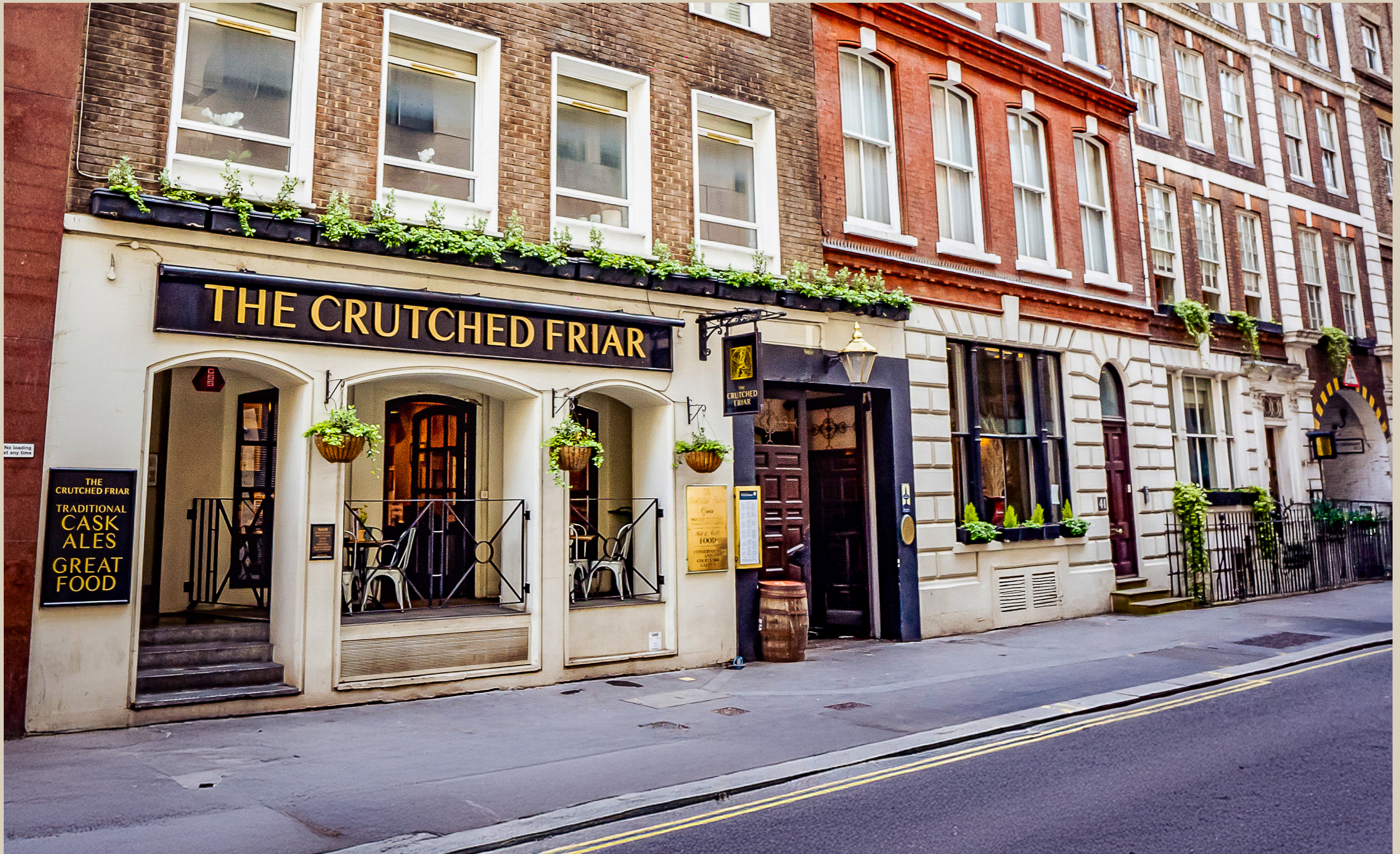
The Crutched Friar, City of London