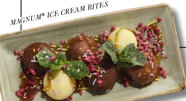
MAGNUM® ICE CREAM BITES

Adults need around 2000 kcal per day. *Contains alcohol. Do you have any allergies? Please inform the team before ordering. For full allergen information and terms & conditions check our main menu.