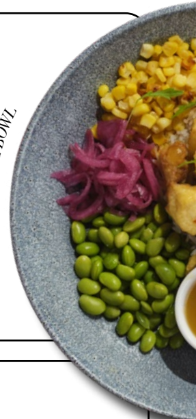
HAWAIIAN RICE BOWL

With a green salad and a beetroot & mint dip, served with your choice of warm grains & brown rice with kale, tomato, soya beans & red onion (+228 kcal) or seasoned skin-on fries (+455 kcal). 362 kcal