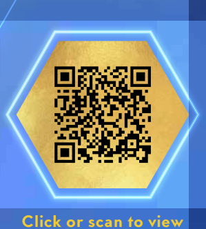
Click or scan to view Masterclass info