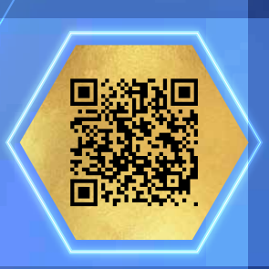
Click or scan to view Masterclass info