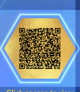
Click or scan to view Masterclass info