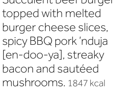
S&L BURGER 12.99 Succulent beef burger

Succulent beef burger topped with a melted burger cheese slice and streaky bacon. 1472 kcal