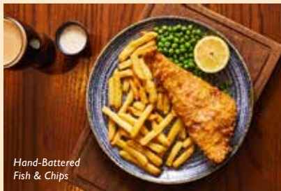
Hand-Battered Fish & Chips

Served with chips, half a grilled tomato and peas. 800 kcal