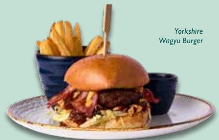
Yorkshire Wagyu Burger

Make it veggie V – swap topped Doritos for chips +62 kcal