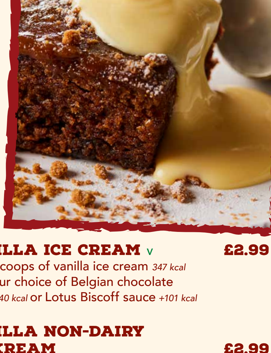
Sticky Toffee Sponge Pud