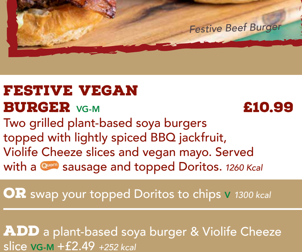
Festive Beef Burger