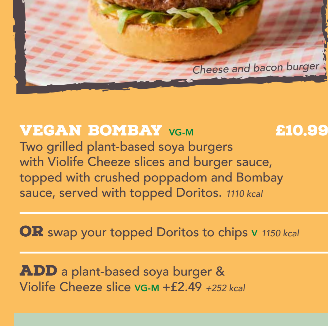
Cheese and bacon burger

ADD a coated chicken burger & burger cheese slice +£2.49 +231 kcal