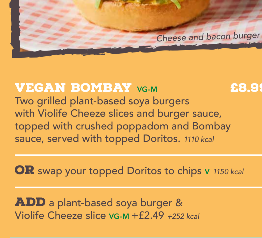
Cheese and bacon burger

ADD a coated chicken burger & burger cheese slice +£2.49 +231 kcal