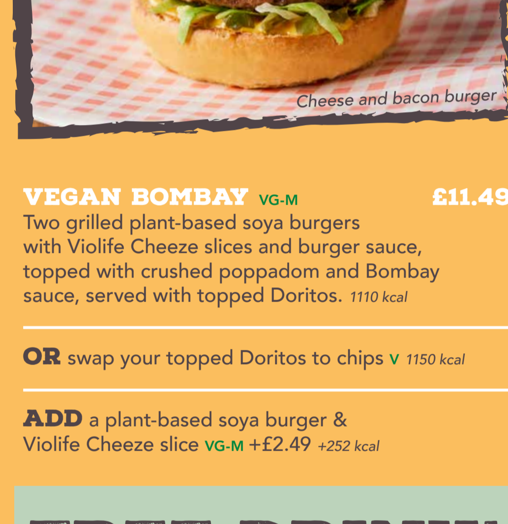
Cheese and bacon burger

ADD a coated chicken burger & burger cheese slice +£2.49 +231 kcal