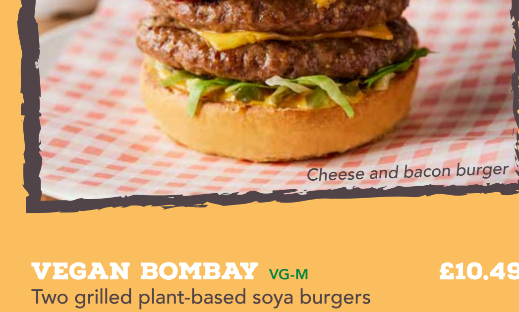
Cheese and bacon burger

ADD a coated chicken burger & burger cheese slice +£2.49 +231 kcal