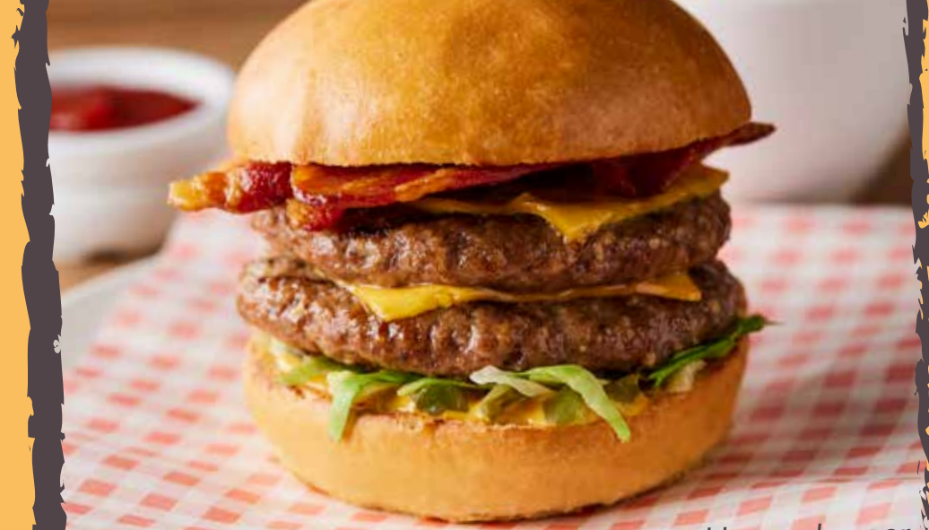
Cheese and bacon burger

ADD a coated chicken burger & burger cheese slice +£2.49 +231 kcal