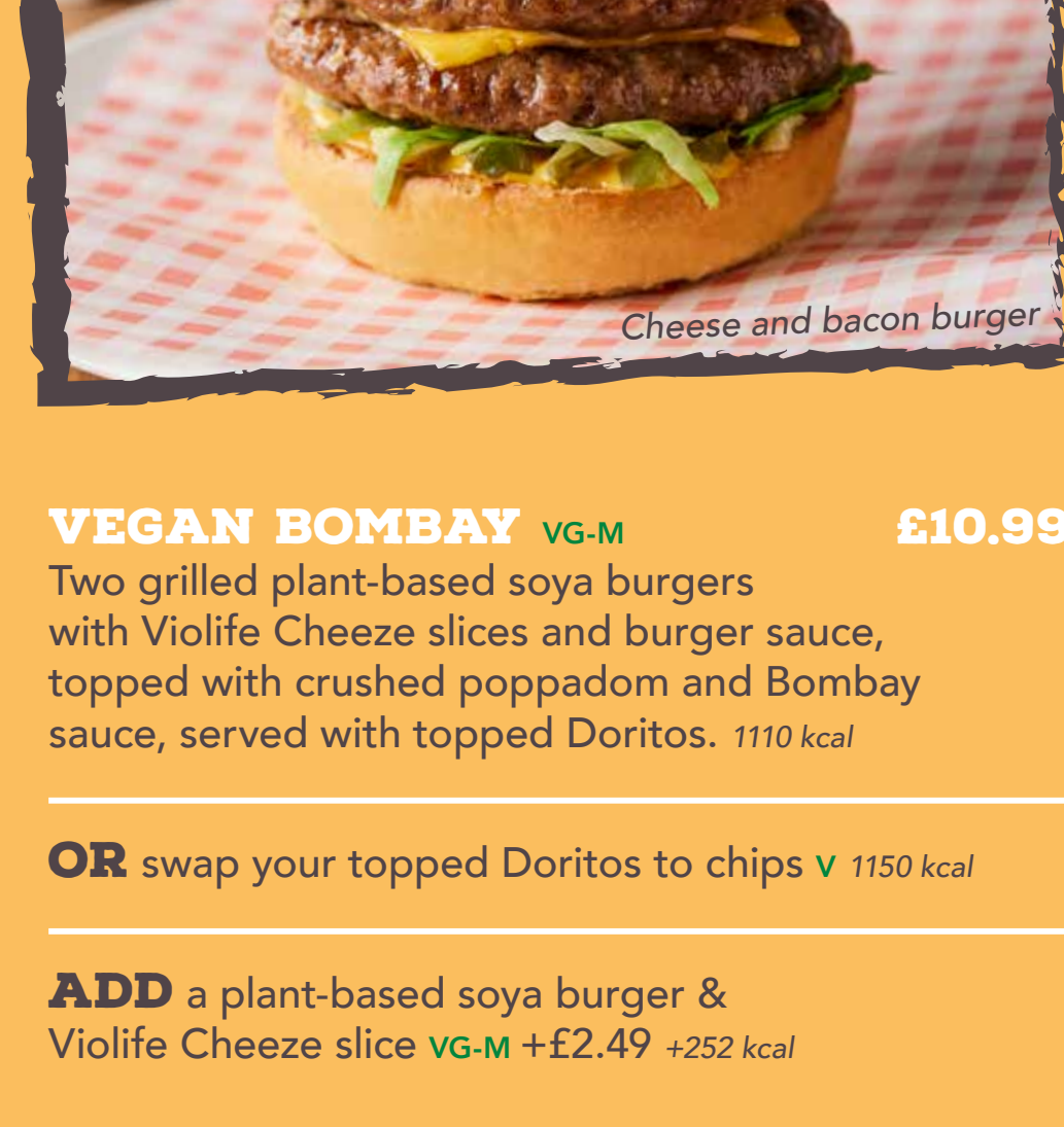
Cheese and bacon burger

ADD a coated chicken burger & burger cheese slice +£2.49 +231 kcal