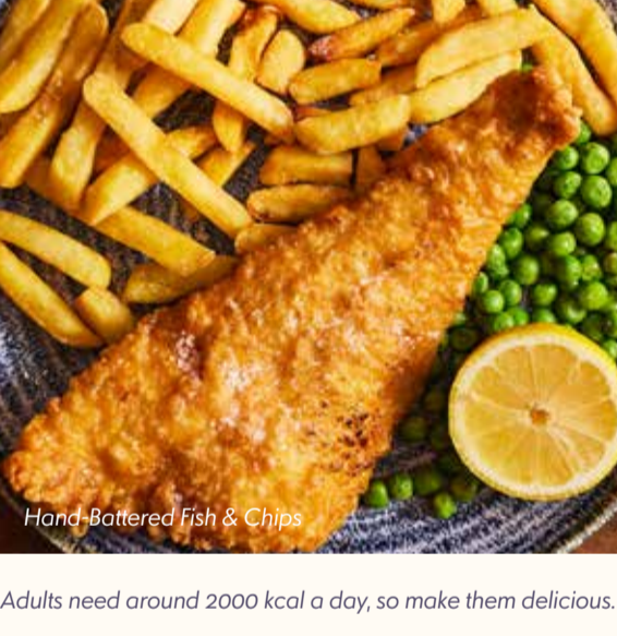
Hand-Battered Fish & Chips