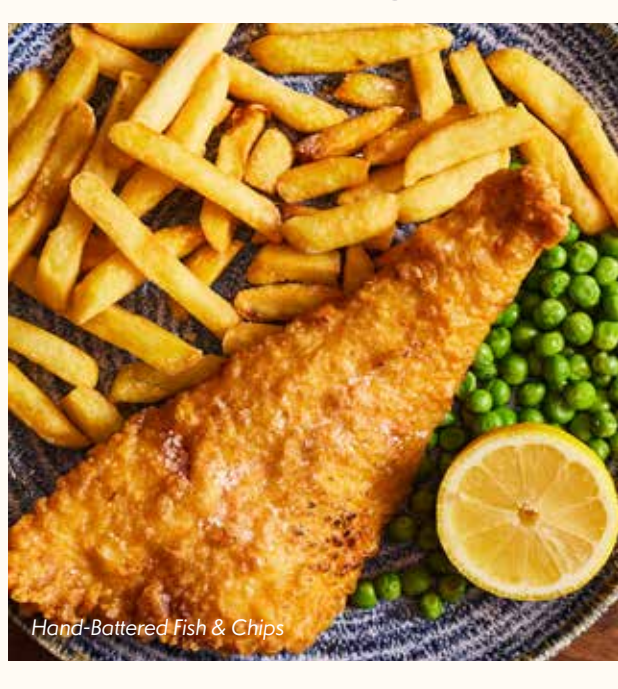
Hand-Battered Fish & Chips

+ 🍷 Buttermilk-Style Fillet 🍃 2.50 +188 kcal