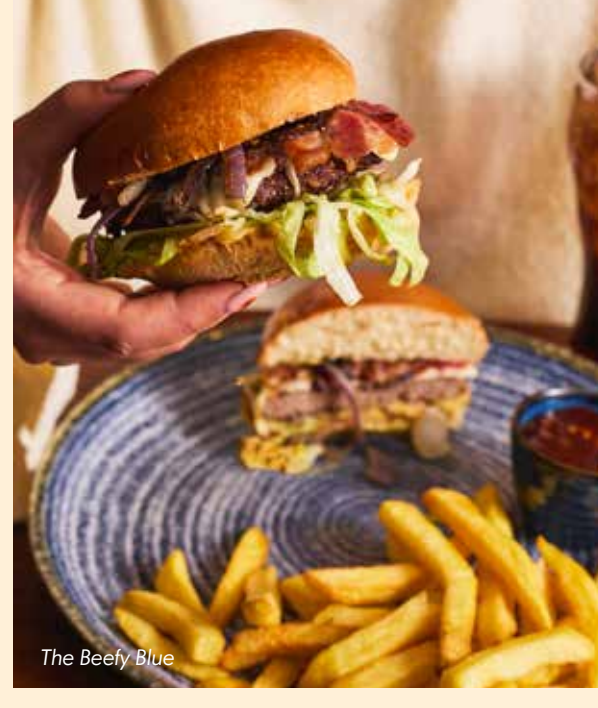
The Beefy Blue