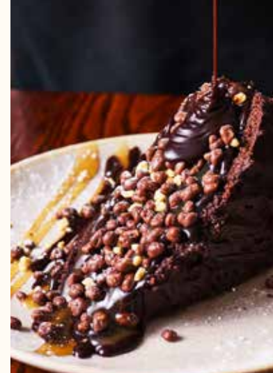
Billionaire's Chocolate Fudge Cake