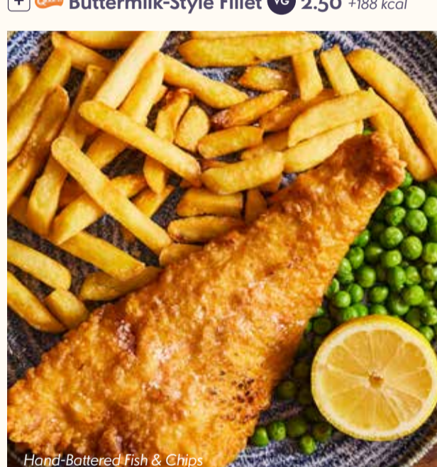
Hand-Battered Fish & Chips