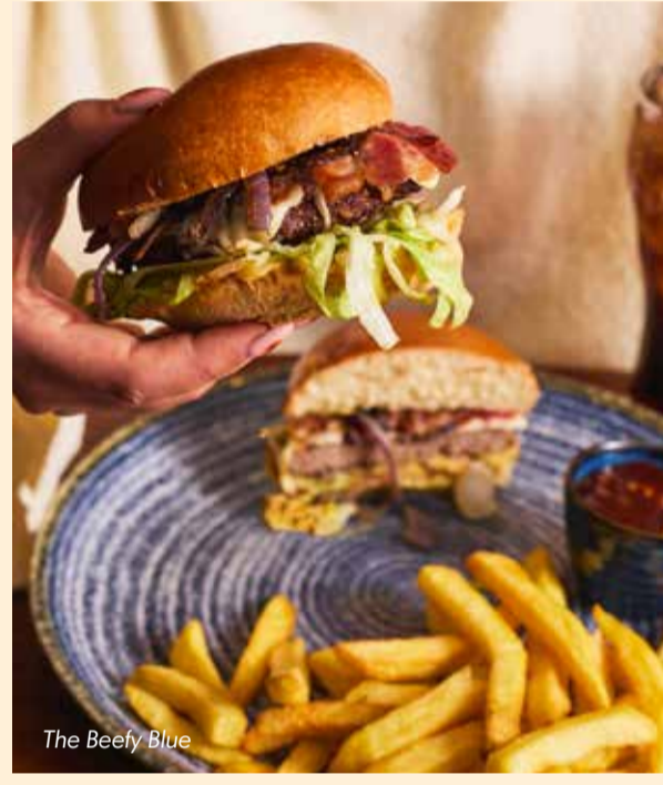
The Beefy Blue