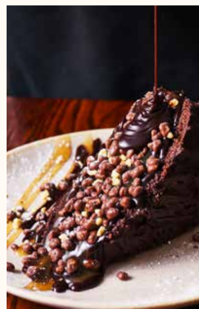
Billionaire's Chocolate Fudge Cake