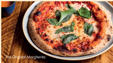
The Original Margherita